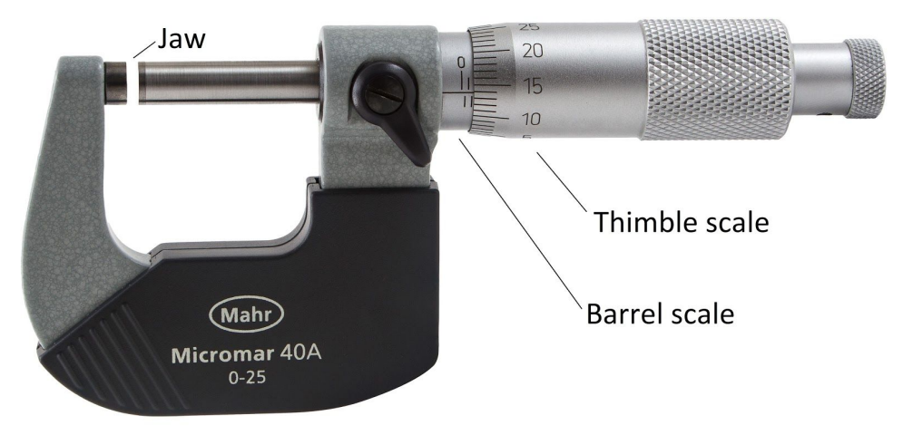
labels are added to the image